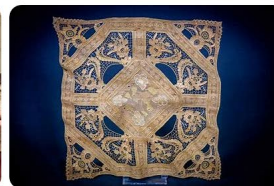
BeCraft – [Expo] Biennale De Mains De Maitres