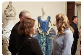
3e biennale « De Mains De Maitres » | Cour grand-ducale