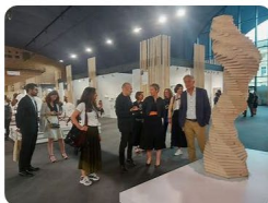
Les artisans luxembourgeois à la Biennale Révélations au Grand Palais ...