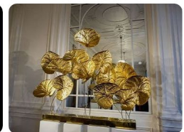
« De Mains de Maitres » : plongée dans le monde des merveilles - Wunnen ...