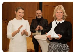
Stéphanie de Luxembourg remet le prix de l'exposition « De mains de ...