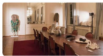
Association De Mains De Maitres