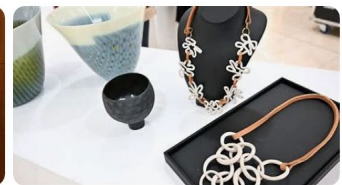
De mains de maitres : 77 artistes sélectionnés